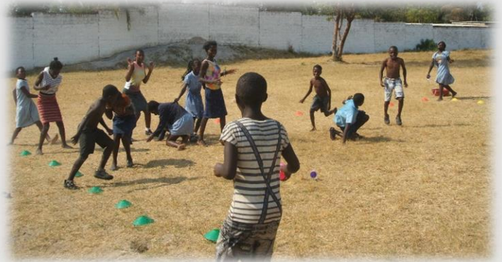
Loving the games involving water in hot season

This term we have been focusing on the armour of God at Youth. Each week we have looked at a different piece of the armour and thought about how we can use this in our everyday life. The young people struggled at first to understand how they could use and wear armour that wasn't physical but they have learned memory verses and begun to think of examples of how they can use it themselves.