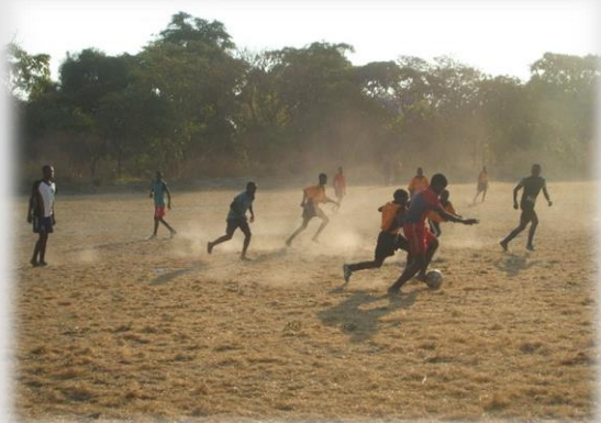
A dusty, dry season football match

Many of our children seem to eat, sleep and breathe football. If there is the opportunity to play – they will. During the last few months the temperature has been climbing and training has needed to be moved to later in the day. As the sun sets in Zambia around 18:00hrs, and some children walk for an hour to come to training, the coaches wondered if children would come just for an hour. They have seen how passionate these pupils are to play. Children have been coming early to play and going to the coaches' house to tell them to come! The Arise team have been blessed with new kit this term and are very excited to play more matches in 2019.