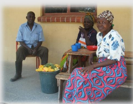
Resting after a morning of watering and harvesting at the farming plot.

the love of God with them and remind them they are never alone. Through the farming programme and discipleship, guardians are able to share the challenges they face with one another and support each other with prayer and practical advice. It is wonderful to see the guardians helping one another and taking God's love into the community of Kaniki as they support their neighbours and friends.