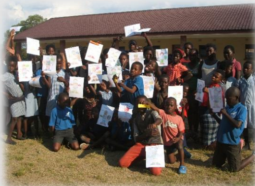
Very proud of their people wearing the armour of God

One week we were asked a question which triggered only more. These children are hungry to learn about God and apply scripture to their lives.