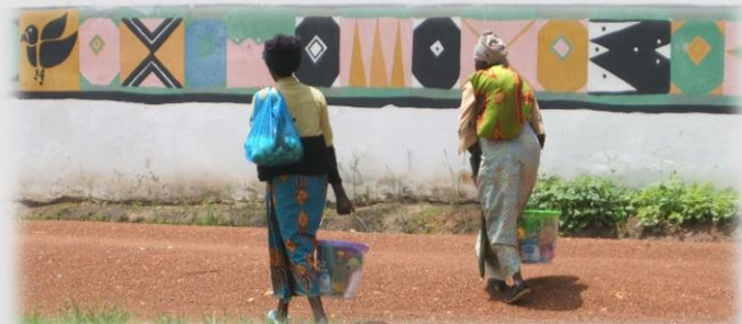
Buckets of blessings ready for the Arise families