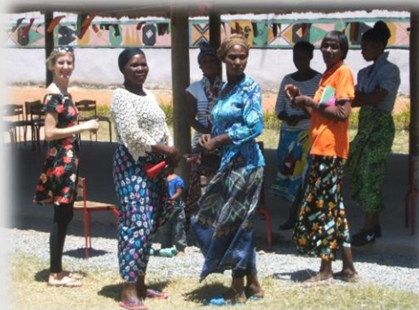
Fellowship time after discipleship.