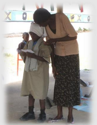
Everyone loves to be chosen to dress up

Thursday afternoons bring a lot of noise and life to the Bible College (they have not complained). We have a mix of ages and Arise pupils from different schools attending. They love to sing, dance, play and learn more about God. It is always a joy to see them and give them opportunities to have fun in a safe environment. They love to learn new games and we make sure that what we do, they can replicate with their friends at home. Due to the afternoon being very hot and the children longing to cool down we played a water game in week 1...which they wanted to repeat the following week. We thank God for the provision of clean water and inspiration for water games each week this term.