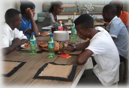
Grade 12's having a pre-exam treat and talk

reach their final school exams at the end of Grade 12, we like to take them for a treat to say well done for completing school, ask them about their future plans and pray with them before the exams. This time was greatly appreciated.