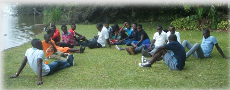
Grade 10's sharing testimonies at Nsobe

During our annual Grade 10 trip to Nsobe Game Park, we had a time for sharing testimonies. Our football coaches (past Arise pupils) came this year and shared their story of how God has been faithful through every stage of their life despite challenges that seemed impossible to pass through. They were able to tell our Grade 10's how honouring God and living for Him is the best way to get through every day of their life – and the twins were living proof.